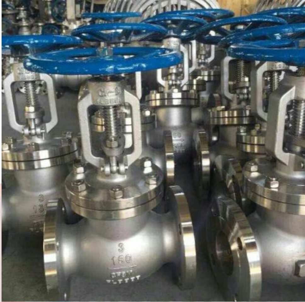
Stainless Steel Globe Valve

Global, Inc. Pumps and Lifting Solutions