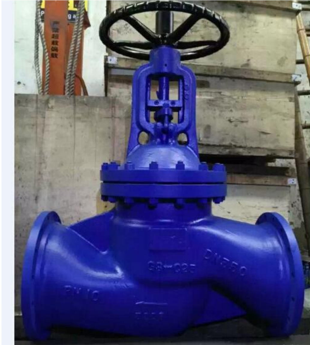
DIN Globe Valve