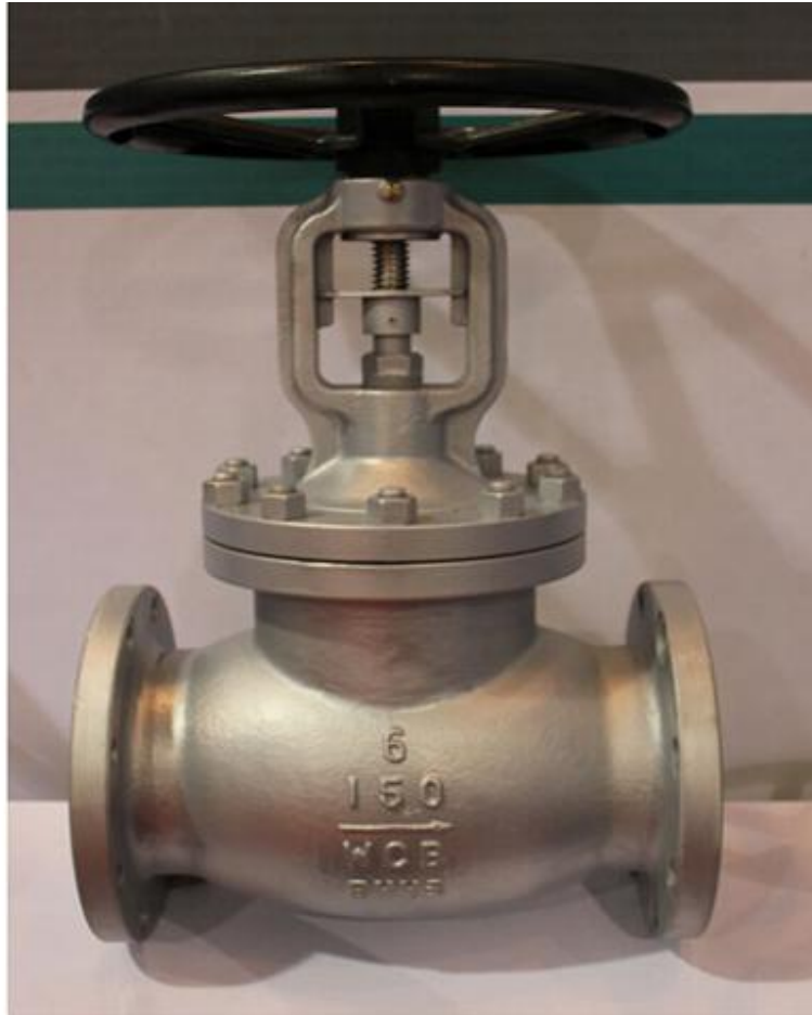
Cast Steel Globe Valve